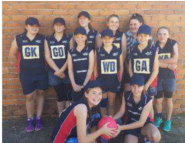
Congratulations to all Broncos competition team members and the winning netball team for the Bowl Award